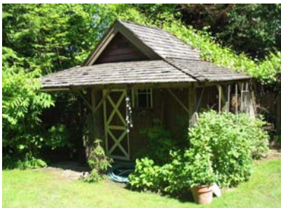
Children's shed in the back garden.

We have another important date to celebrate. This year marks the 15 th anniversary of Second Story Treasures Thrift Store. Since the actual date is September 17, 1998, stay tuned for upcoming celebrations in the fall. The Hospice Thrift Store continues to be a strong and dependable source of revenue for Langley Hospice. It is amazing to note that 70 volunteers contributed 17,187 hours over the past year to ensure that merchandise is sorted, steamed/washed, and displayed creatively on the store shelves. The Spring Fling "Turn-over" day on March 30 resulted in record daily sales of $5,121.75 . Due to the dedication of the community, including volunteers, donors and customers, our sales keep increasing – this year the store sales are up by 8% which is a